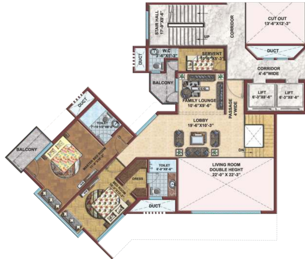
Pent house: upper floor plan